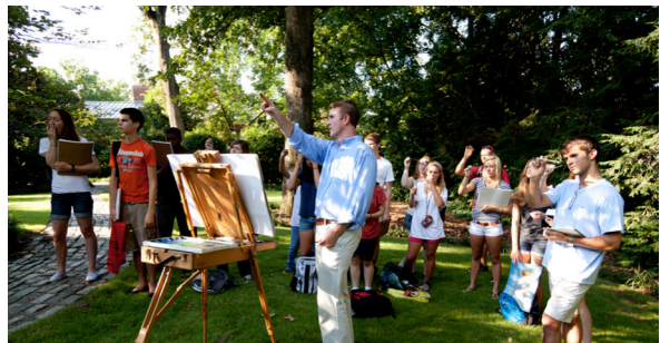
UGA PUBLIC AFFAIRS

19% of FY students report that they frequently make presentations in class.