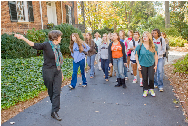
UGA PUBLIC AFFAIRS

39% of FY students at least occasionally spent time with faculty members on activities other than coursework.